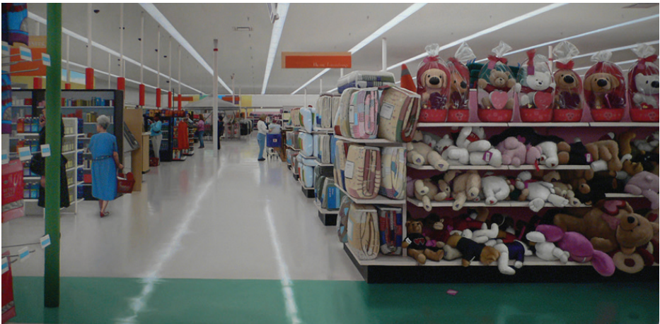
1000 San Fernando Road, 2006