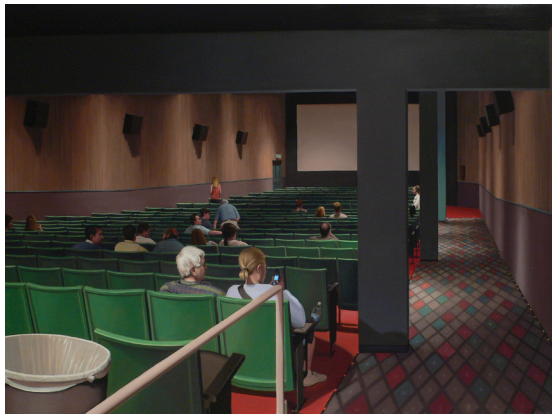
6356 Bellingham Avenue, 2006

In the 1970s a new generation of American photographers made their mark by turning their eyes away from ordinary people of the kind that so fascinated their FSA precursors toward the places those absent Everymen and Everywomen once inhabited. Thus Lewis Baltz, Robert Adams, and Joe Deal trained their cameras on housing developments and the infrastructure of suburbia.