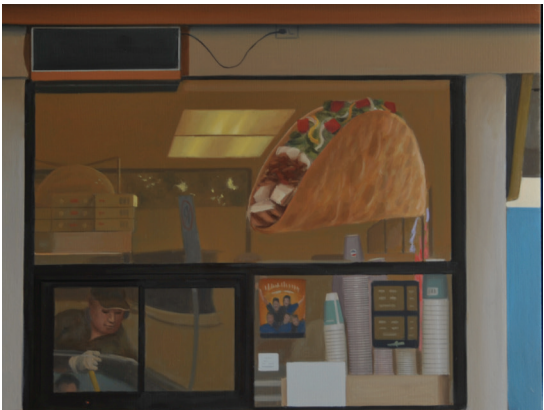
1603 S. La Brea, 2009

In both paintings the mirror image upon which Trujillo fastened is an optical “readymade.” That the artist not only remains constantly on the lookout for such anomalies but assiduously plans their realization can be inferred from the grisaille, or gray-scale, studies he has made for several works in this exhibition. To call them “studies” implies that they are incomplete versions of their chromatically complete alter egos, yet, when encountered on their own, they are just as satisfying in their leached-out fashion as their full-color companion pieces; they are more purgatorial, even. Furthermore they remind one not only of tonal magazine illustrations by the likes of Frederick Remington—who as fate would have it was a graduate of Yale University, like both Downes and Trujillo—but also of the wondrously elaborate and resolved gray panels on the backs of Northern European Renaissance altarpieces by artists such as Hans Memling and Jan van Eyck.