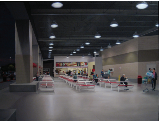
1052 West Burbank Boulevard, 2006